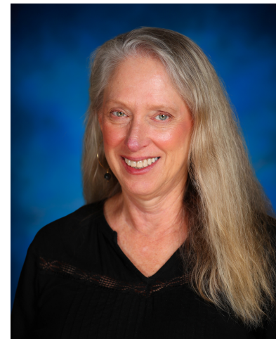
Ellen Blaine Science

📁 https://drive.google.com/file/d/1woukonWUn_T0CgMeKqEIF6k5-Qww0H_n-/view?usp=drive_link