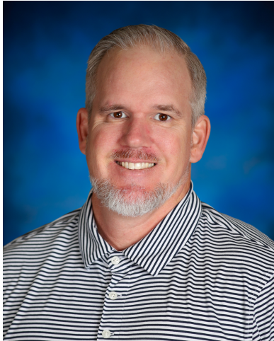
Swift Livingston Social Studies