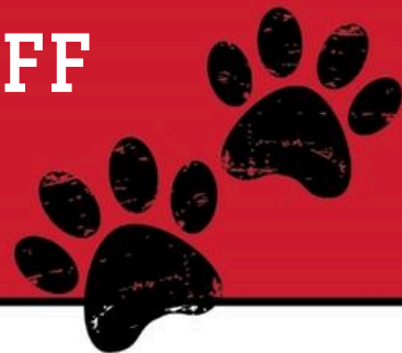
PHOTO COMING SOON