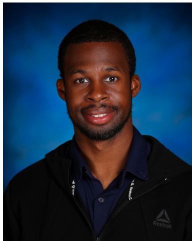
Markeith Woods Art

https://drive.google.com/file/d/1lcrAzmz5zlpE-cydmOHUgLGsG1FNbb9F/view?usp=drive_link