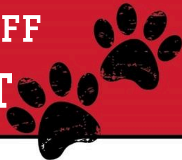
PHOTO COMING SOON