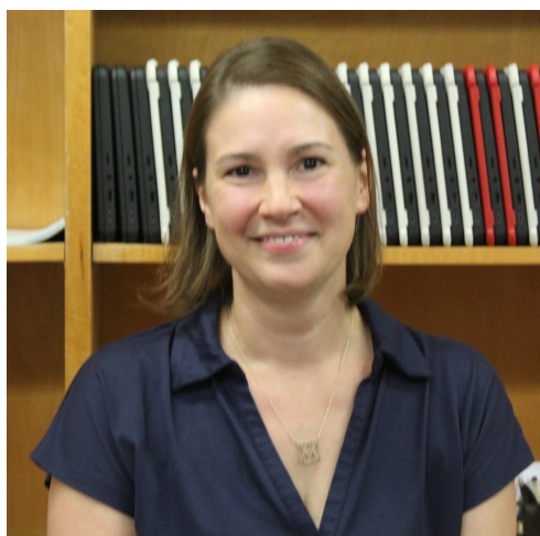
Jamie Pope Technology

https://drive.google.com/file/d/1zRyfEYs5rjurf45Gplt0Kuw4YGzol4SO/view?usp=sharing